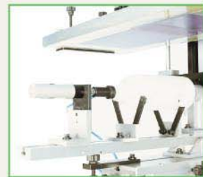
- Air inflation unit