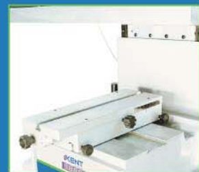
- Work table