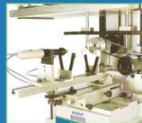
- Registration unit