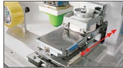
Platform in / out movement (Pad clean underneath)