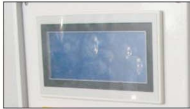
PLC control touch screen panel