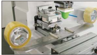
Auto pad clean